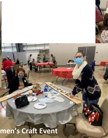
Women's Craft Event