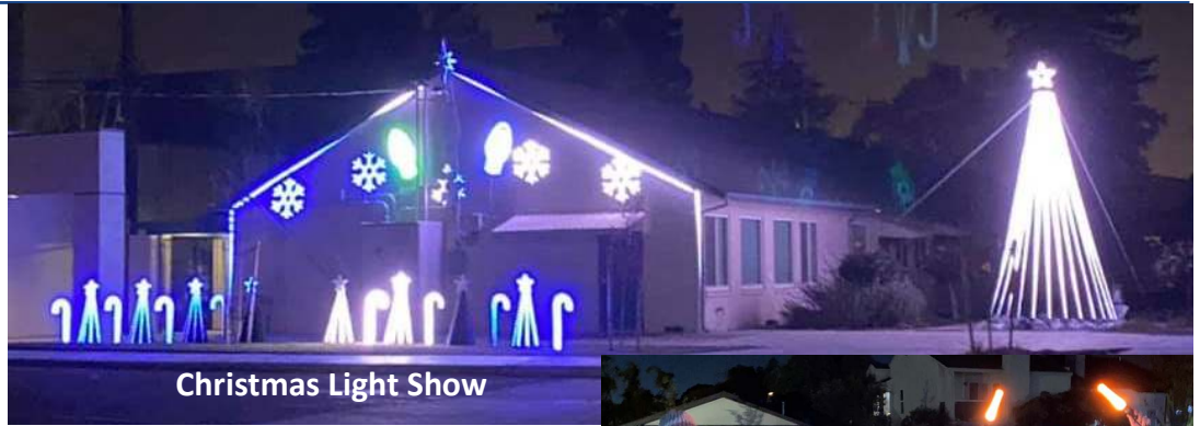
Christmas Light Show