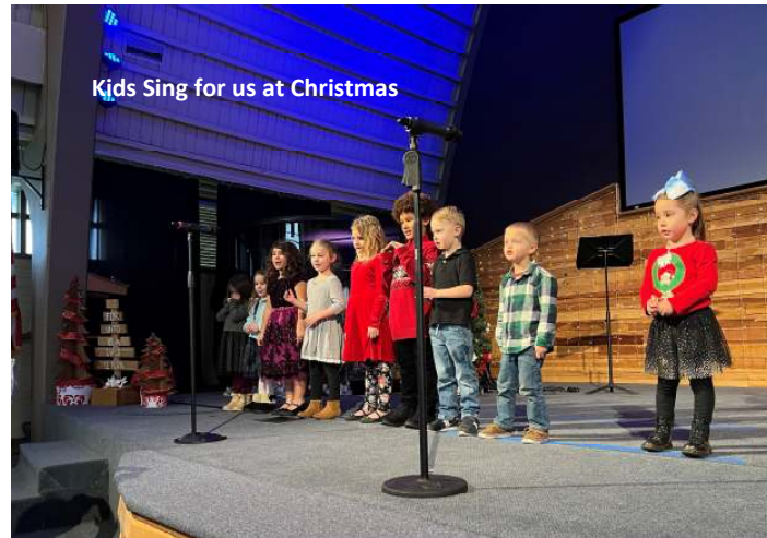
Kids Sing for us at Christmas