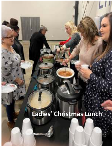
Ladies' Christmas Lunch