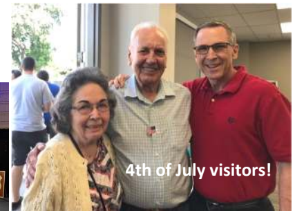
4th of July visitors!