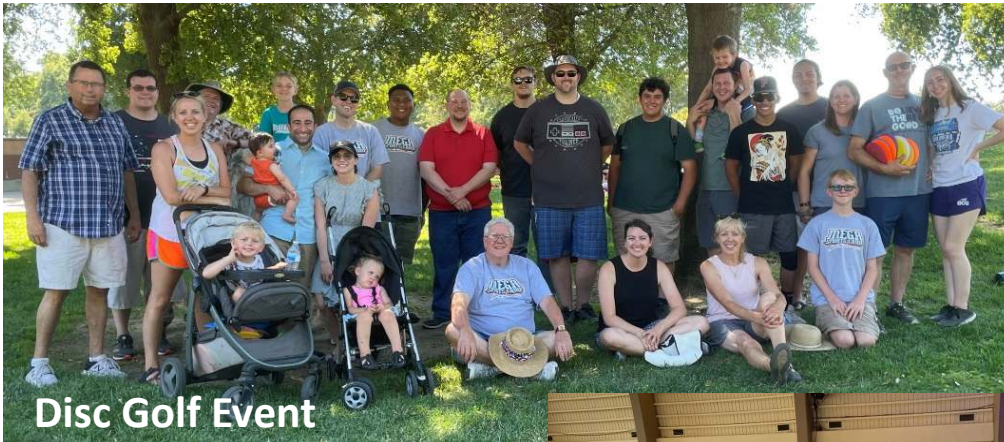
Disc Golf Event