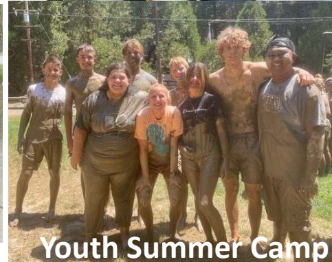
Youth Summer Camp