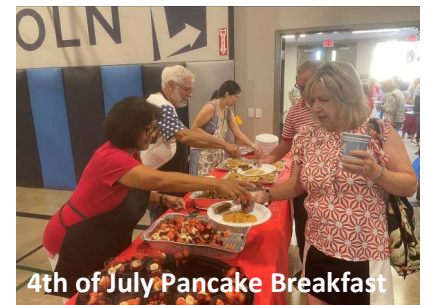
4th of July Pancake Breakfast